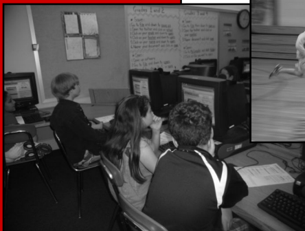
Learning to use the tracking system