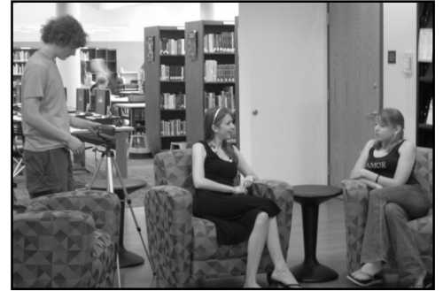
Avon High journalism students practicing on camera interviewing techniques