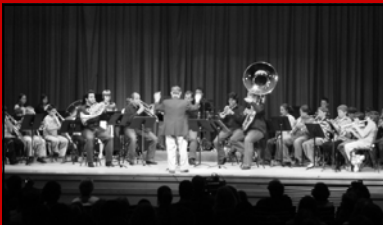
April 3, 2007—Avon band students perform with the Dallas Brass

“In her classroom our speculations ranged the world. She aroused us to book waving discussions.