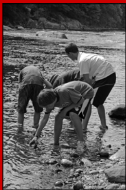
RIGHT: 8th grade scientists at the Farmington River doing "Research in Real Time."